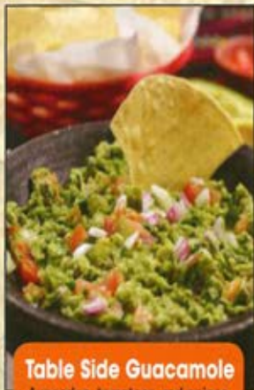
Table Side Guacamole

Avocados, tomatoes, red onions, jalapenos, and spices. Made fresh at your table 7.99